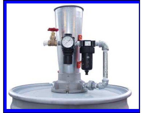
AIR-TECH 55 Blower